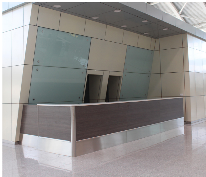
DINOX boarding counter Houari Boumediene Airport, Algeria