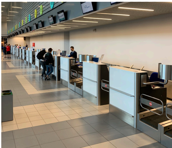
DINOX check-in counters Zakynthos Airport, Greece

The DINOX counter is a durable and versatile counter. The counter consists of high-quality fiber plates that can be finished in different colors. The front can be finished with an HPL (in any color or pattern) or with a back-painted glass front, the back of which is painted in a chosen color. The front and sides have a protective corner and stainless steel plinth. The top can be finished with solid surface or composite available in many different colors and patterns.