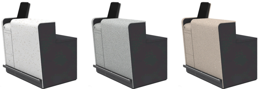
Impression of possible color options